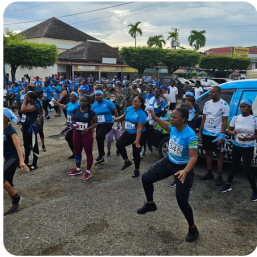
is Prostate Cancer Awareness Month