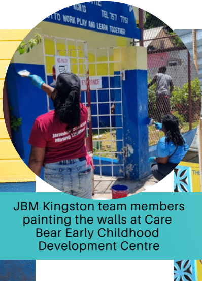
JBM Kingston team members painting the walls at Care Bear Early Childhood Development Centre