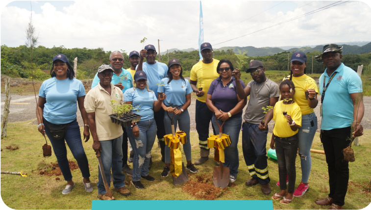
The JBM and Forestry Department Teams at Beulah Park's Tree Planting

This Labour Day, JBM contributed to five (5) community upliftment projects across the parishes of St. Ann and Kingston. Each of our teams descended upon educational institutions, sports facilities and housing communities in the spirit of volunteerism and togetherness.